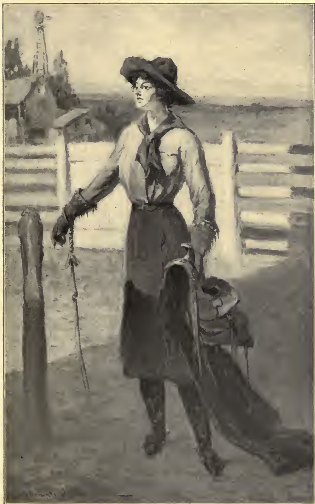
Her appearance now was in the nature of a transformation